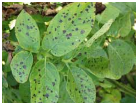
Infection 13 September 2011

Dacom Alternaria Disease Pressure Charts (infection periods in red) 2010 - Signum DSS applied 9 June after large infection period